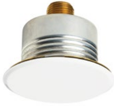
V3801 and V3802