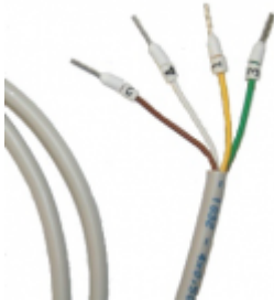
Cable for connection in twin booster sets 4x0.5mm 2 100 cm (SR-CBL4X05-100)