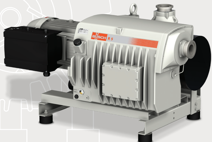
R 5 RA 0750 A

R 5 RA 0750 A – perfectly suited to heat treatment and coating processes.